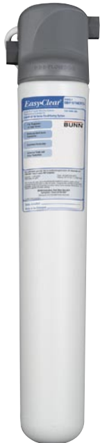
Model EQHP-ESP Water Quality System